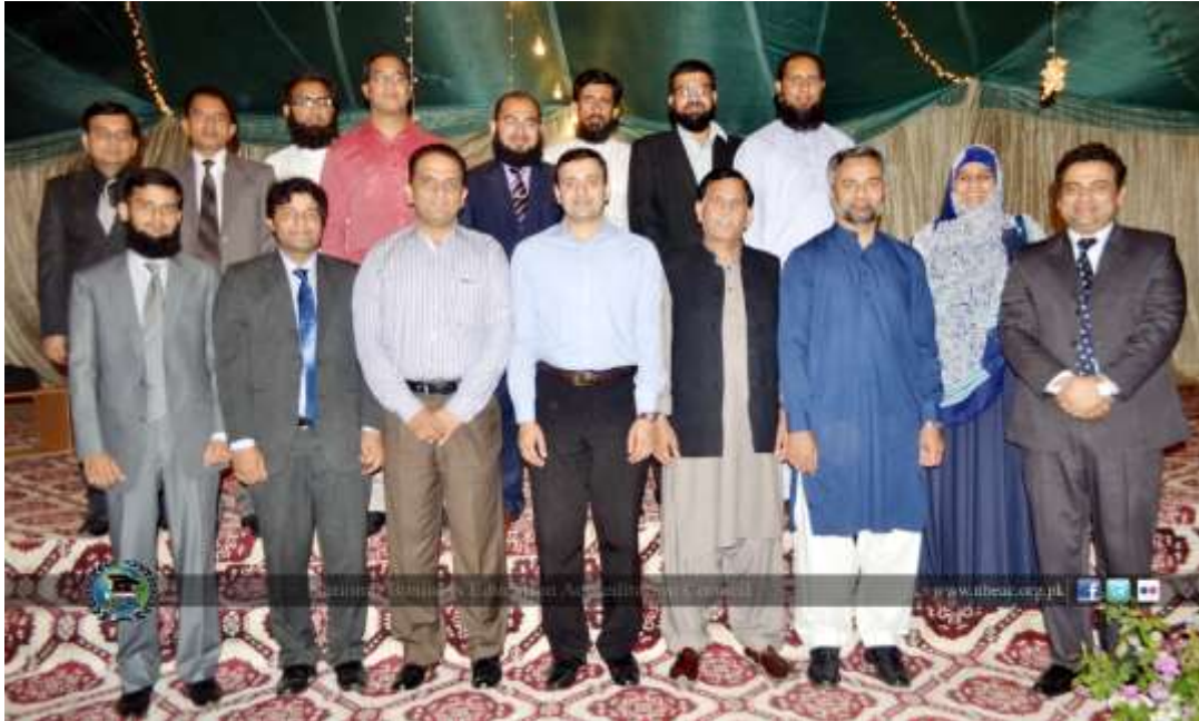
National Business Education Accreditation Council, Accreditation Inspection Committee visits of BZU-Multan 21st to 23rd April, 2014