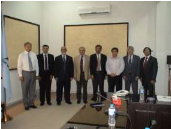
National Business Education Accreditation Council, Accreditation Inspection Committee visits of Air University, Islamabad.

The council ensures transparent and neutral external evaluation and this accreditation process is developed with the continuous effort of expert academicians. Substantial recommendations based upon the Peer review visits are shared with the management of the Universities / Business Schools.