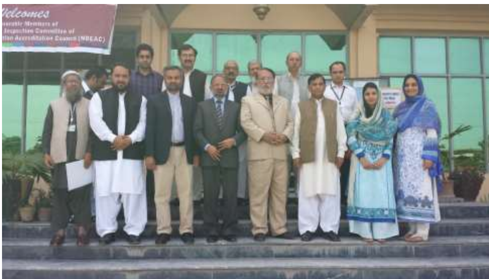
NBEAC accreditation Inspection committee visited CECOS University Peshawar on 8-10 April, 2014